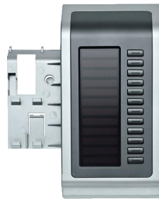
Figure shows OpenStage key module 80.

OpenStage key module with 12 programmable keys and automatic key labeling.